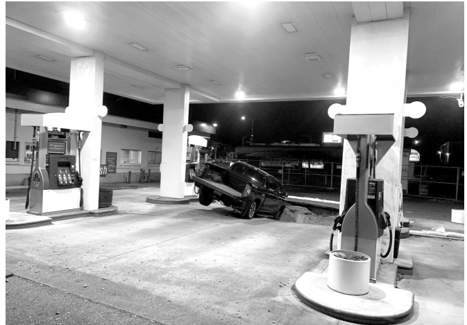
Figure 1. Abandoned Gas Station, Seattle, Washington