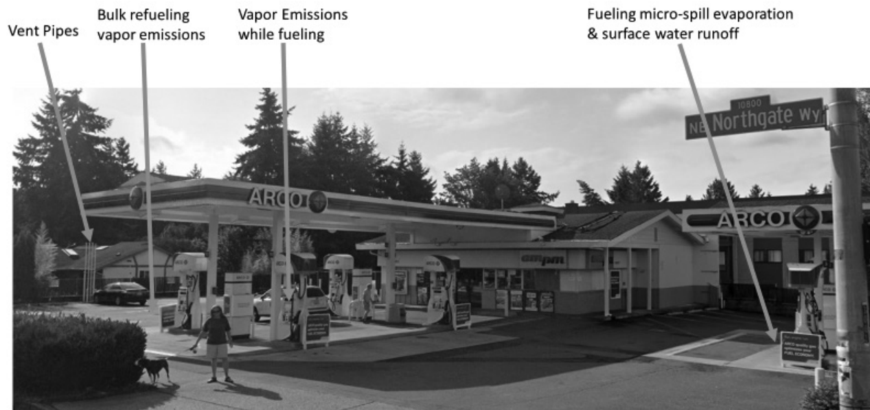
Figure 2. Gas Station Air Pollution Pathways